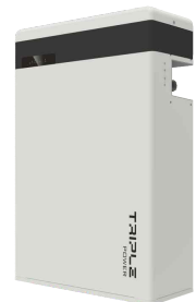
LiFePO 4 5.8kWh